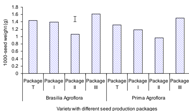
Figure 3. Combined effect of variety and different production packages on 1000-seed weight of carrot

Package T: Carrot uprooted after 75 days, transplanted 1 January without root cut, spacing 25cm×25cm, N 124 P 52 K 120 S 3.6 kg/ha fertilizers apply; Package I: Seed treated at 8°C temperature, 25% root cut, treated with Dithane M-45, kept at 12°C, transplanted 1 December, spacing 20cm×25cm, N 124 P 52 K 120 S 3.6 Zn 4 B 3 Cu 2 Mo 2 kg/ha fertilizers apply; foliar spray 150 ppm GA 3 ; Package II: Seed treated at 12°C temperature, intact root kept at 8°C, transplanted 15 November, spacing 20cm×20cm, N 124 P 52 K 120 S 3.6 Zn 3 B 4 Cu 2 Mo 2 kg/ha fertilizers apply, foliar spray 200 ppm GA 3 ; Package III: Seed kept at room temperature, 50% root cut, treated with Bordeaux paste, kept room temperature, transplanted 15 December, spacing 25cm×25cm, N 124 P 52 K 120 S 3.6 Zn 0 B 2 Cu 2 Mo 2 fertilizers apply, foliar spray 100 ppm GA 3 ; ** indicates significant LSD at 1% levels of probability; CV = Coefficient of variation