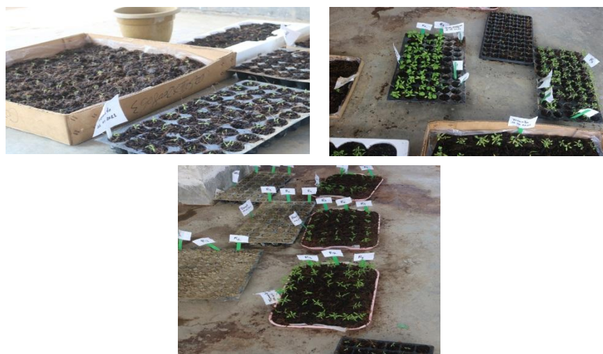
Figure 1 Seeds of tomato and bell pepper germinated in soil, sawdust and cocopeat

Fifty plastic pots were filled with sawdust. The base of the pots was perforated to ensure proper drainage of water and aeration. Before filling up into the pots the sawdust were first moistened with water to improve moisture condition and reduce transplant shock. Staking was done at the time of fruiting. Ten days old tomato and bell pepper seedlings were transplanted (3 seedlings/bucket) into plastic pots filled with sawdust as growing medium and 10 seedlings were planted on the soil to serve as control for each crop (Fig. 2).