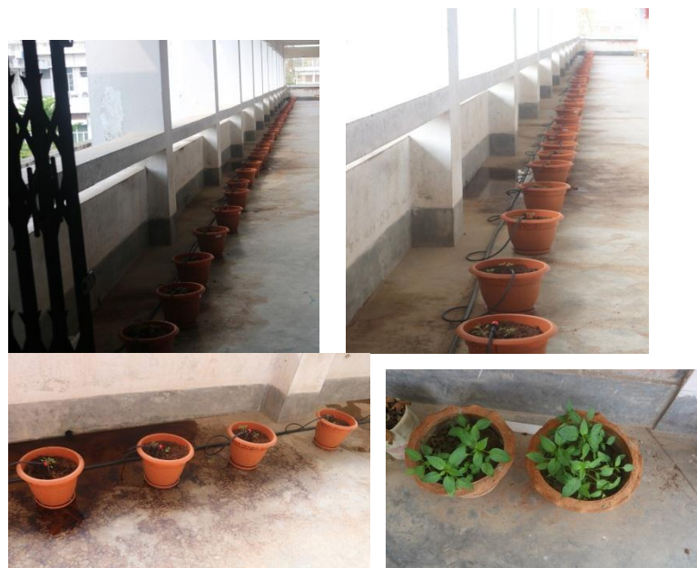
Figure 2 Transplanting the seedlings in plastic pots containing sawdust and soil